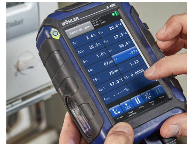
5" large color touchscreen All measured values available at a glance thanks to high-resolution display.

1) Wöhler A 450 L: 24 months; Wöhler A 450 / 450 H: 48 months; excludes thermocouples, rechargeable battery and optional NO sensor. For more information please see our Terms and Conditions.