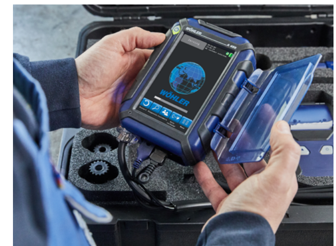
Perfect size Compact and light in a plastic case.