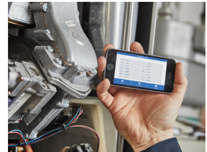
Wöhler A 450 App (Android & iOS) Displaying the measured data on a mobile device.