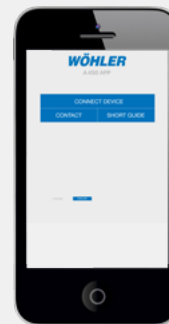
Homepage of the Wöhler A 450 App

Do you prefer to do everything with your smartphone or tablet? Then the Wöhler A 450 App is exactly the right choice for your measuring and adjustment work. No matter if you are using an Android or iOS device.