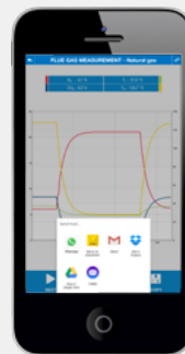
Dispatch of measurement data to the customer