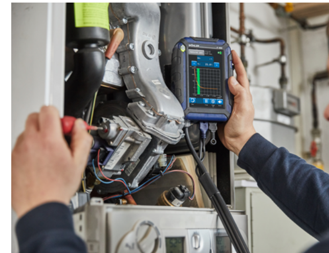
All values at a glance The tuning guide offers an advanced guidance to the technician to properly adjust the burner.