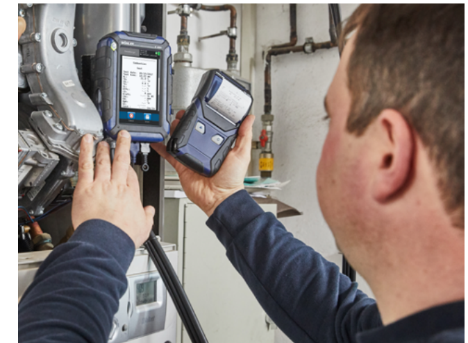
Interface to the printer Printout of the measured data on site.