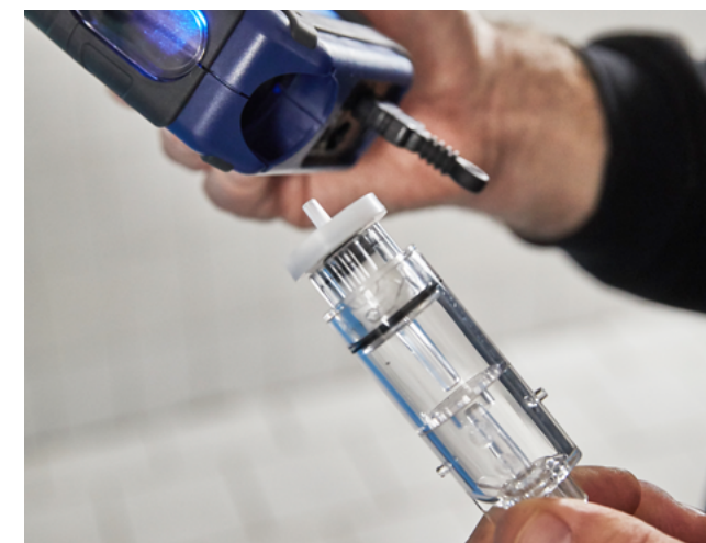
Easy maintenance Condensate trap can easily be pulled out to change cotton wool and water stop filters.