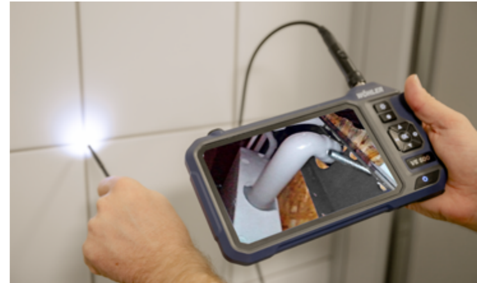
A Ø 6 mm opening in a tile cross is sufficient to inspect the installation behind the wall.