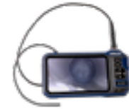
Wöhler VE 500 HD-Video-Endoscope