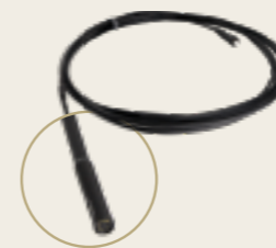
HD-Video-Endoscope-Probe (3 Cameras) Ø 7.9 mm / 10 m / 0° / 2 x 90° Article no. 11417