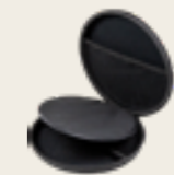
Protection bag for Wöhler VE series and probes Article no. 6914