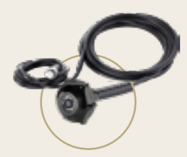
HD-Video-Endoscope-Probe Ø 25 mm / 3 m Article no. 6911