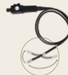
HD-Video-Endoscope-Probe (swivelling) Ø 6.2 mm / 1.5 m / 180° Article no. 11321