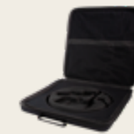
Large protective bag for Wöhler VE series and probes Article no. 10185