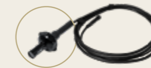
HD-Video-Endoscope-Probe (3 Cameras) Ø 25 mm / 5 m / 0° / 2 x 90° with roller guide Article no. 11419