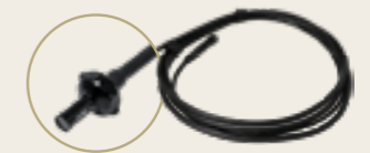
HD-Video-Endoscope-Probe (3 Cameras) Ø 25 mm / 10 m / 0° / 2 x 90° with roller guide Article no. 11418