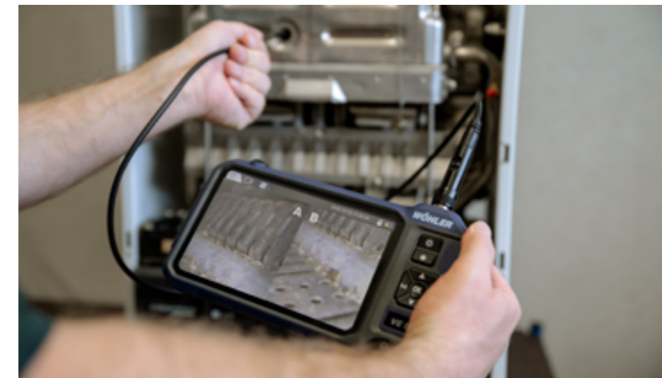
The split-screen mode allows you to display both camera images of the combination probe simultaneously to capture everything at a glance.