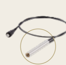
HD-Video-Endoscope-Probe Ø 3.9 mm / 1 m Article no. 6929