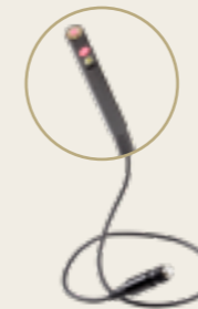
HD-Video-Endoscope-Probe (2 Cameras) Ø 5.5 mm / 1 m / 0° / 90° Article no. 11415