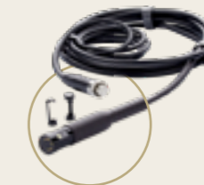
HD-Video-Endoscope-Probe (2 Cameras) Ø 8.5 mm / 3 m / 0° / 90° Article no. 11416