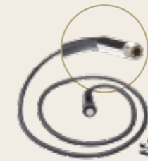
HD-Video-Endoscope-Probe Ø 5.5 mm / 1.2 m Article no. 7787